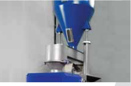
The material is fed into the Pulverizer by a vibrating dosing channel, the feeding rate is automatically adjusted based on the motors amperage and material temperature.