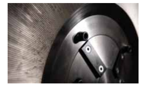
The ZERMA PM Pulverizers can be equipped with either one piece or segmented grinding discs, both are made from high quality tool steel and can be treated to withstand wear longer.